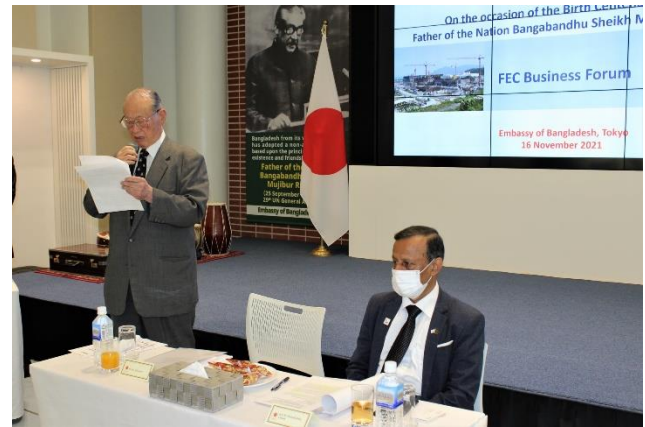
Participants of the Seminar