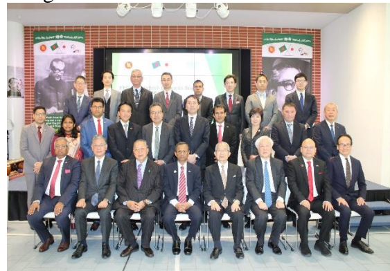
Participants of FEC-Bangladesh Business Seminar held in the Bangladesh Embassy in Tokyo

The Ambassador recalled the visit of Father of the Nation Bangabandhu Sheikh Mujibur Rahman to Japan in 1973 and said that the visit laid the foundation of a steadfast and lasting friendship with Japan. He said, relation between Bangladesh and Japan has been elevated to 'Strategic Partnership' during Prime Minister Sheikh Hasina's latest visit to Japan in April 2023, which created and increased opportunities for cooperation and collaboration with Japan in many key areas. He outlined in brief the excellent economic progress the country made over the last 15 years under the prudent and dynamic leadership of Prime Minister Sheikh Hasina. He urged Japanese businessmen and investors to come forward to invest more in various sectors in Bangladesh.