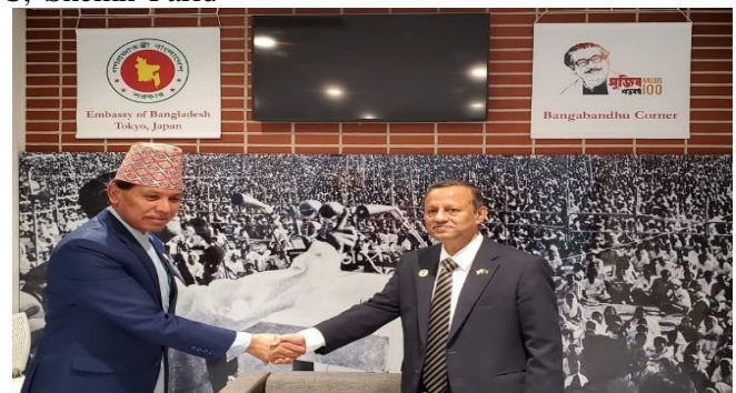
Nepalese Ambassador also visited Bangabandhu Corner