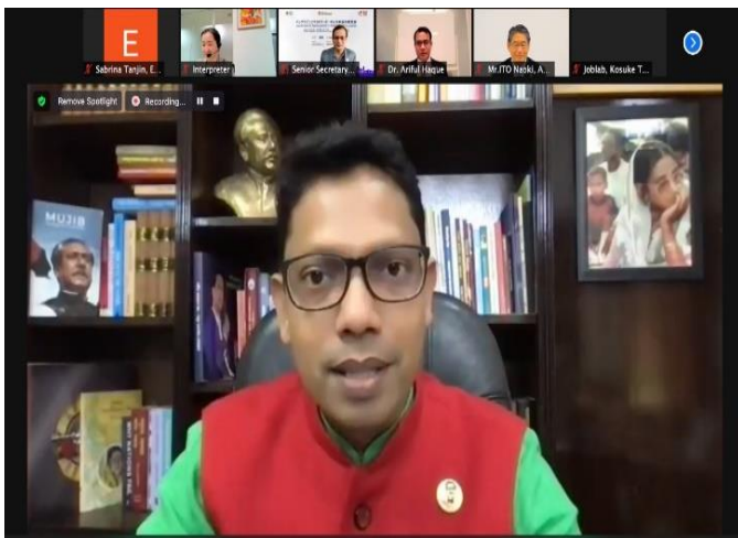
Hon'ble State Minister for ICT, Mr. Zunaid Ahmed Palak inaugurated the virtual desk