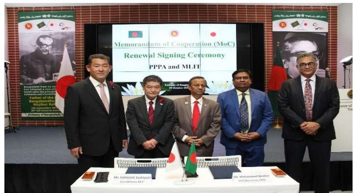
Renewal Signing Ceremony of Memorandum of Cooperation (MoC) between Bangladesh Public-Private Partnership Authority and Ministry of Land, Infrastructure, Transport and Tourism (MLIT), Japan on 5 October 2022