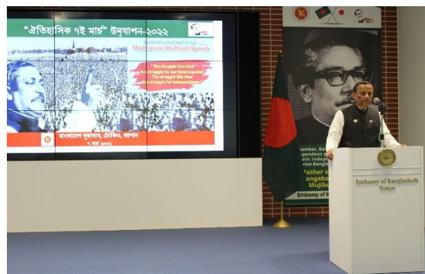
H.E Mr. Ambassador Shahabuddin Ahmed delivering speech

Following the pandemic guidelines, the program resumed indoors with offering of special prayer (munajat) for the salvation of the souls of the Father of the Nation, his family members and all martyrs as well as for the peace and prosperity of the country under the leadership of Prime Minister Sheikh Hasina. The messages issued by the Hon'ble President and Hon'ble Prime Minister on "Historic 07 March Speech" were read out.