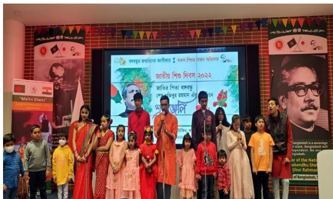
Children enthralled all present with their colorful performance

an enabling environment for the children of the new country to flourish could not be implemented. After this, the Ambassador along with the invited guest cut a cake to celebrate this joyous occasion. As the last element of the program, a special documentary on the life of the Father of the Nation Bangabandhu Sheikh Mujibur Rahman was screened. The participants were then entertained with traditional Bangladeshi cuisine.