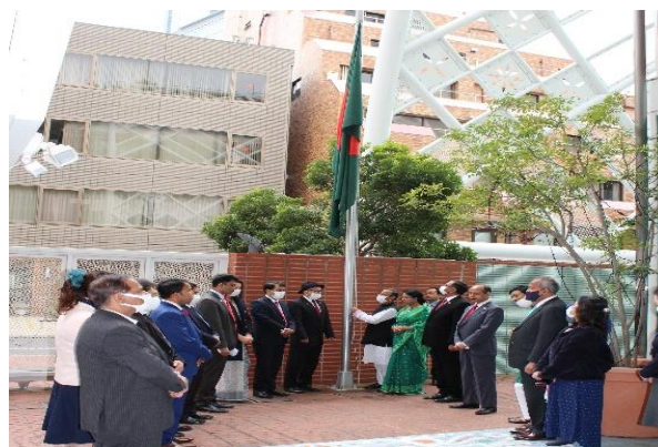
Hoisting of the national flag along with rendition of national anthem