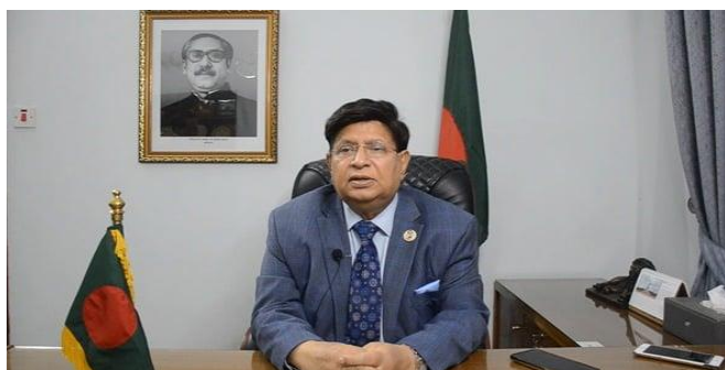
Hon'ble Foreign Minister Dr. A. K. Abdul Momen, M.P and Hon'ble Minister for Liberation War Affairs Mr. A K M Mozammel Haque delivered their speeches

A seminar was jointly organized by the Embassy of Bangladesh in Japan and the Tokyo University of Foreign Studies (TUFS) on the occasion of the 50th anniversary (Golden Jubilee) of independence of Bangladesh on 30 March 2022 at 10:30-11:55am (Bangladesh Time) and 1:30-2:55pm (Japan Time) in a hybrid webinar format. The embassy put efforts for organizing the event in the month of independence.