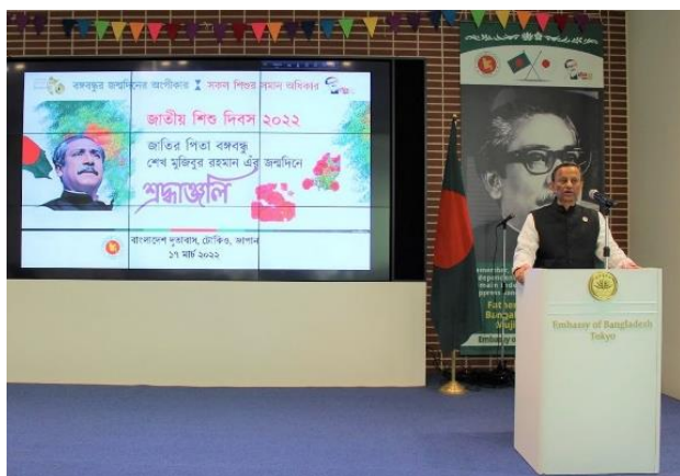
H.E. Mr. Shahbuddin Ahmed delivered his speech

Prayer was also offered for the peace and prosperity of the country and people along with the wellbeing of the children of Bangladesh and all around the world. The messages issued by Hon'ble President, Hon'ble Prime Minister, Hon'ble Foreign Minister and Hon'ble State Minister of Foreign Affairs on the occasion were read out by Embassy officials. In his remarks, Ambassador Ahmed paid homage to the Father of the Nation Bangabandhu Sheikh Mujibur Rahman and explained the significance of the 17th of March. Ambassador mentioned that the theme for this year's Children's Day is "Equal rights of the children, Commitment of Bangabandhu's Birthday". Ambassador stated that Bangabandhu had a charismatic leadership quality and magnetic appeal to his people.