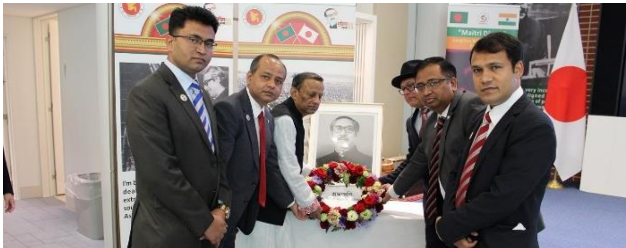
Placing floral wreath at the portrait of the Father of the Nation

This was followed by offering of special prayer (munajat) for the salvation of the souls of the Father of the Nation and his family members.