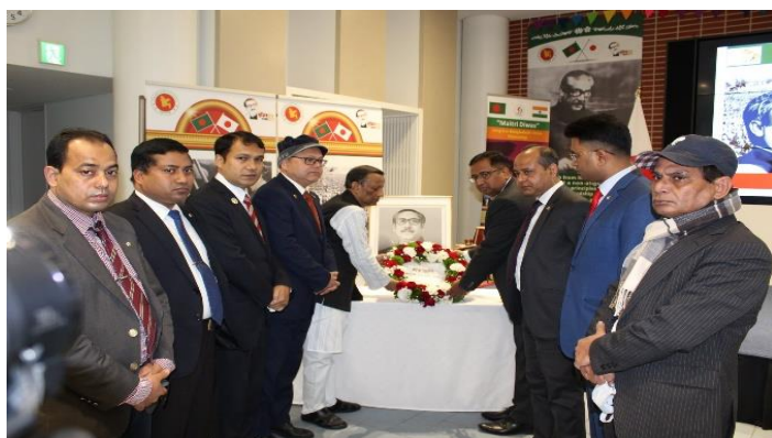
Placing of floral wreath at the portrait of the Father of the Nation located at the embassy premises

The Embassy of Bangladesh, Tokyo observed the Historic 7 th March on March 07, 2022, with due respect and fervor by recalling the epoch-making speech of Father of the Nation Bangabandhu Sheikh Mujibur Rahman made on this very day in 1971. The day's program was inaugurated by placing of floral wreath at the portrait of the Father of the Nation located at the embassy premises in the early morning. In the second part of the event, H.E. the Ambassador hoisted the national flag along with the rendition of the national anthem. This was followed by observance of 01 (one) minute silence in remembrance of the Father of the Nation, his family members and to the memories of the martyrs who sacrificed their lives in the journey of independence.