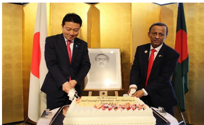
Chief Guest and H.E. the Ambassadors conducted cake cutting ceremony