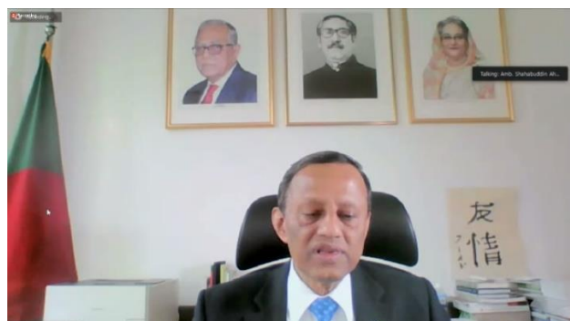
H.E. Mr. Shahabuddin Ahmed made his remarks as a guest of honor