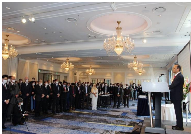
Delivering speech by H.E. Mr. Shahbuddin Ahmed

and various ministries and agencies of Japan, Members of Parliament, Ambassadors and representatives of diplomatic missions, renowned businesspersons, academicians, journalists from Japan and Bangladeshi expatriates attended.