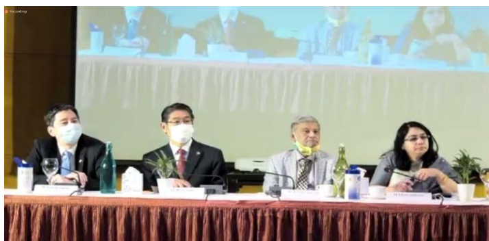
Hon’ble Minister for Planning, Mr. M. A. Mannan MP graced the program as the Chief Guest