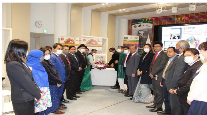
Placing of floral wreath at the portrait of the Father of the Nation