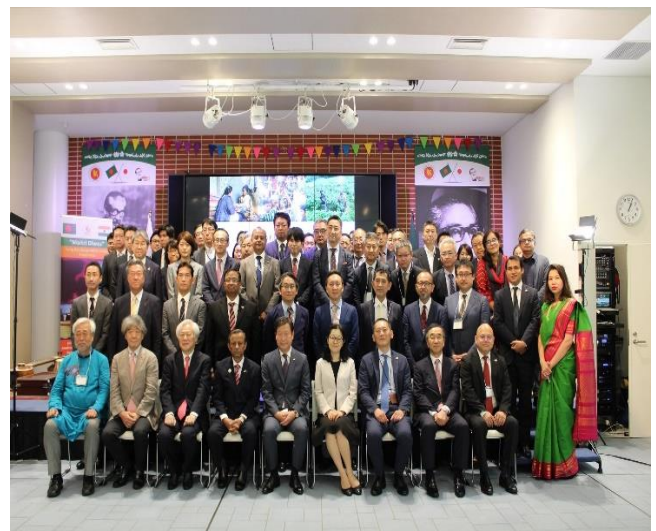
Participants of the seminar