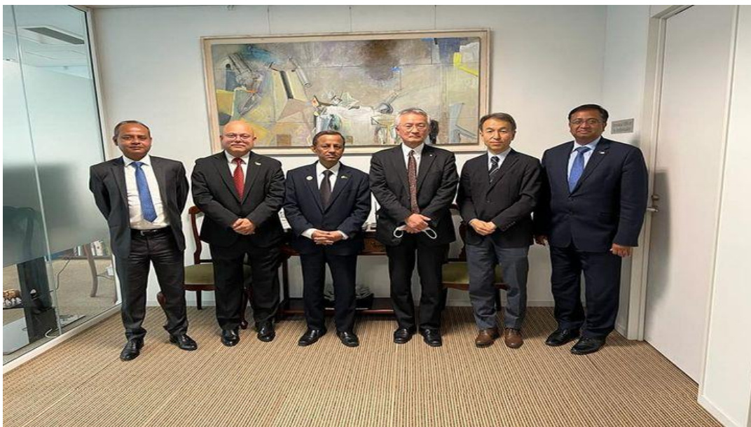
A delegation of University of Hyogo, a public university in Kobe, visited the Embassy