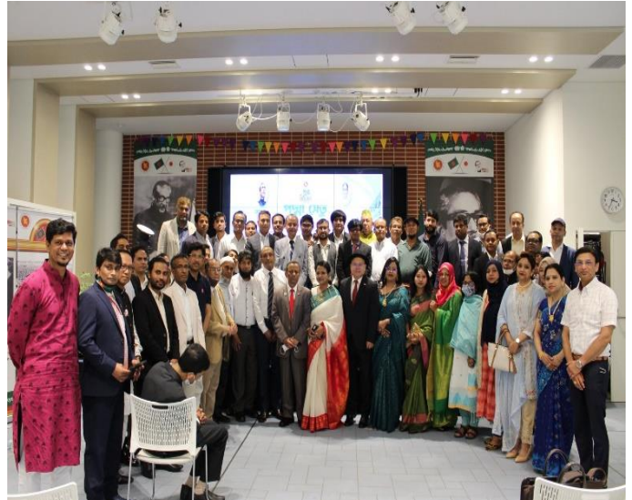
Expatriates of Bangladesh attended the program