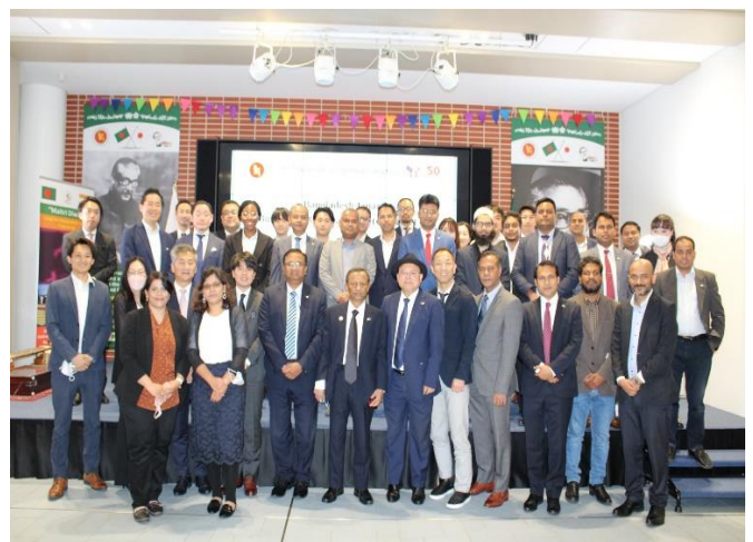
Participants of the event