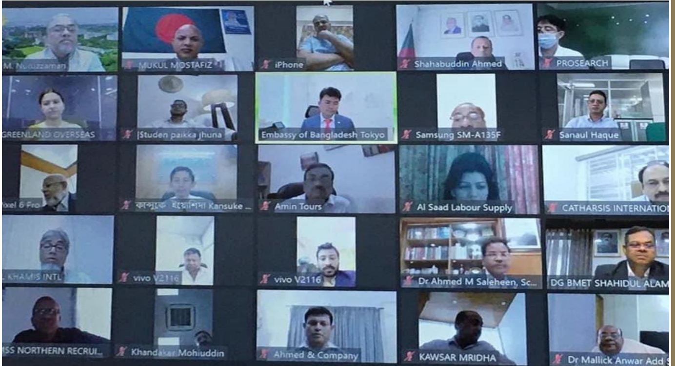
Participants of the seminar