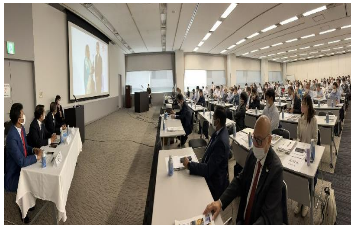
Participants of the seminar