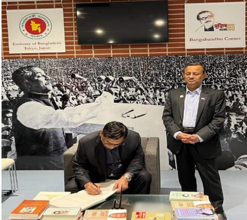
Hon'ble State Minister visited Bangabandhu Corner

2022. H.E Ambassador Mr. Shahabuddin Ahmed briefed the Hon'ble Minister on various activities of the Embassy.