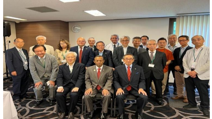
Participants of AGM of JBS