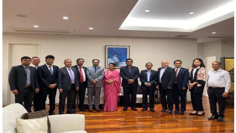
Hon'ble State Minister with embassy officials and his delegation

He also visited Bangabandhu Corner of the Mission and penned his remarks in the guest book there. H.E. Ambassador hosted a dinner in honour of the visiting