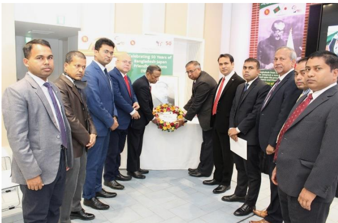
Laying of floral wreath at the portrait of the Father of the Nation Bangabandhu Sheikh Mujibur Rahman