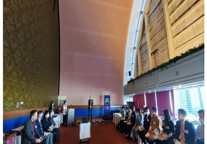
The Embassy of Bangladesh in Tokyo attended the award presentation ceremony of FALIA