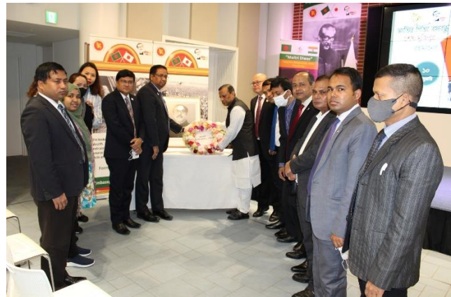
Placing floral wreath at the portrait of the Father of the Nation