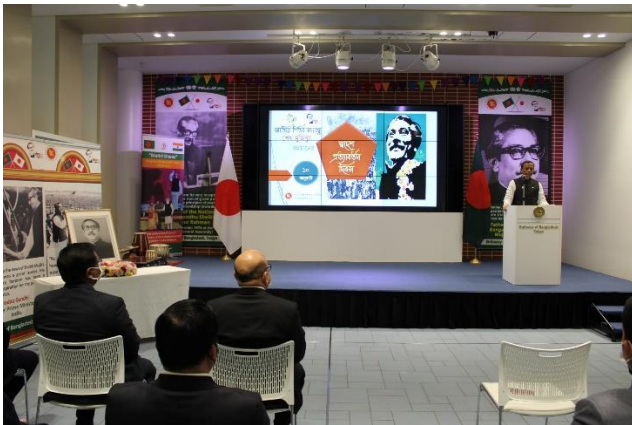
Remark of H.E. the Ambassador of Bangladesh to Japan on Homecoming Day

H.E. the Ambassador paid profound homage to the Father of the Nation and prayed for his departed soul. He also paid solemn tribute to the four national leaders, all the freedom fighters and martyrs of independence, to all women who lost their dignity during the war and the organizers of our War of Liberation. A discussion on the significance of the day and recitation of poem on the Homecoming Day of the Father of the Nation were also held in the program along with screening some of the historical moments of Bangabandhu's Homecoming.