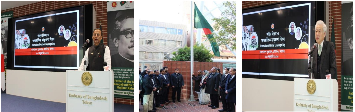
The Embassy of Bangladesh, Tokyo celebrated the Shaheed Dibash and International Mother Language Day on 21 February 2023

The Embassy of Bangladesh, Tokyo celebrated the Shaheed Dibash and International Mother Language Day on 21 February 2023 with due respect, solemnity and enthusiasm. Events organized to mark the day was inaugurated in the early morning with offering of floral wreath at the altar of the temporary Shaheed Minar located at the Embassy premises. Expatriate Bangladeshis and invited Japanese friends of Bangladesh along with Embassy officials attended the program.