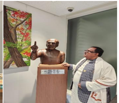
Hon'ble Minister for Food, H.E. Sadhan Chandra Mojumder, MP visited Bangladesh Embassy