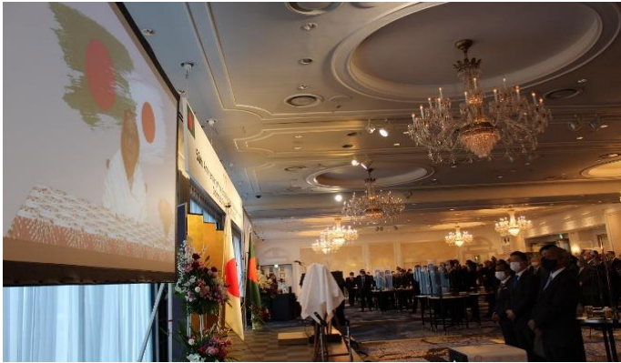
Congratulatory video messages by Hon'ble Prime Minister of Bangladesh Sheikh Hasina