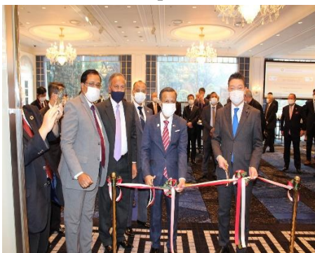
Inauguration of exhibition by Chief Guest and H.E the Ambassador

An exhibition of diplomatic archive documents and photographs showcasing the past and present of the bilateral