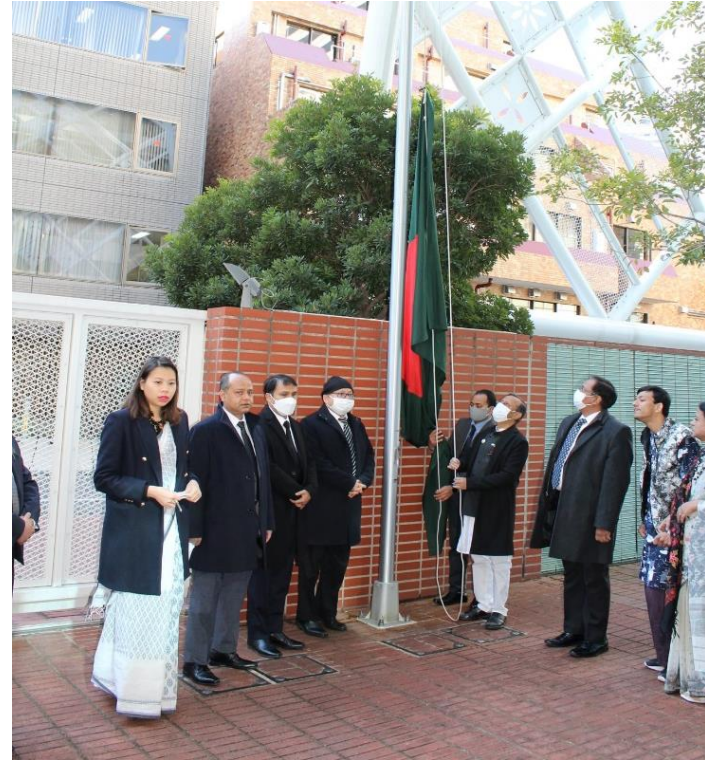
Celebration of the Shaheed Dibash and International Mother Language Day 2022 in Tokyo