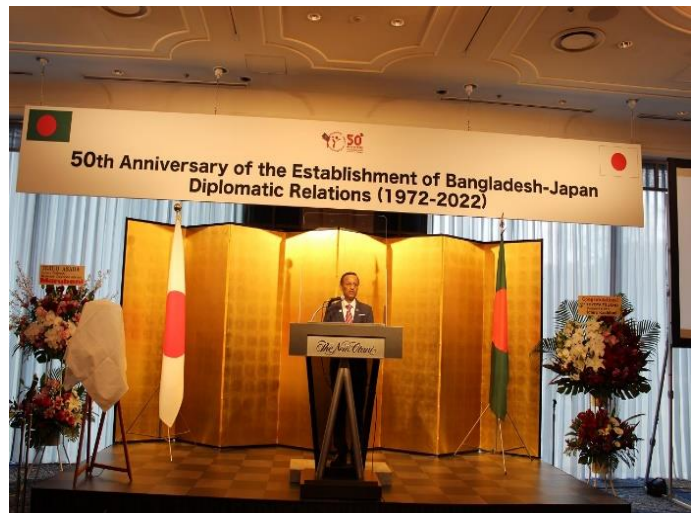
Welcome remark by H.E. the Ambassador of Bangladesh to Japan