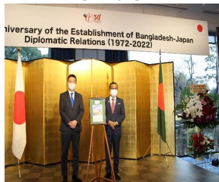
Unveiling of design of commemorative stamps by Japan Post