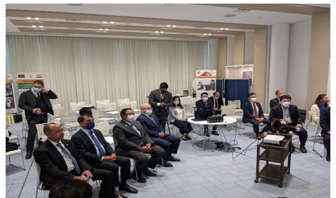
The Embassy of Bangladesh, Tokyo arranged a virtual signing ceremony on February on 16, 2022 on “Agreement Concerning Technical Intern Training Program” between BOES of Bangladesh and ZENBI CO-OP of Japan