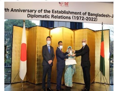
Presentation of commemorative coin by Japan Mint

relations between Bangladesh and Japan, unveiling of design of commemorative stamps by Japan Post, presentation of commemorative coin by Japan Mint enriched the content of the momentous occasion. The event ended by the viewing of video titled “Welcome Bangabandhu” on the historic visit of the Father of the Nation Sheikh Mujibur Rahman to Japan on 18-24 October 1973.