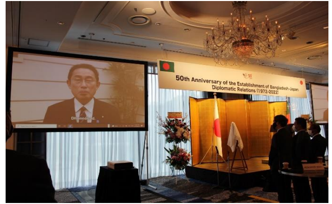
Congratulatory video messages by Hon'ble Prime Minister of Japan Fumio Kishida

of pride as fellow Asians, the tremendous achievements of Japan in the social and economic fields which constitute one of the most powerful influences of our time.” He further added, “The experience of Japan cannot but hold lessons for other countries such as ours”. Ambassador Shahabuddin recalled that following the experience of Japan, Bangabandhu wanted to turn Bangladesh into a major social and economic force. The congratulatory video messages from Prime Minister Sheikh Hasina of Bangladesh and Prime Minister Fumio Kishida of Japan were screened followed by video message of Foreign Minister of Bangladesh, Dr. A K Abdul Momen and message from the President of the Japan-Bangladesh Parliamentary Friendship League, Mr. Taro Aso.