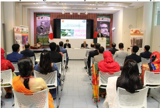
The Embassy of Bangladesh, Tokyo has organized an orientation program for the incoming JDS fellows

JDS fellows who arrived in Tokyo recently to pursue Master degrees under JICA scholarship in eight universities across Japan.