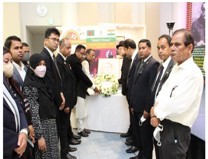
Laying a floral wreath by Embassy officials at the portrait of Bangabandhu on the National Mourning Day

Later at the Bangabandhu Auditorium, Ambassador Ahmed and other participants paid deepest homage to the Father of the Nation Bangabandhu Sheikh Mujibur Rahman by laying a floral wreath at the portrait of Bangabandhu. Messages of the Hon'ble President, Hon'ble Prime Minister, Hon'ble Foreign Minister and Hon'ble State Minister for Foreign Affairs issued on the occasion were read out to the audience.