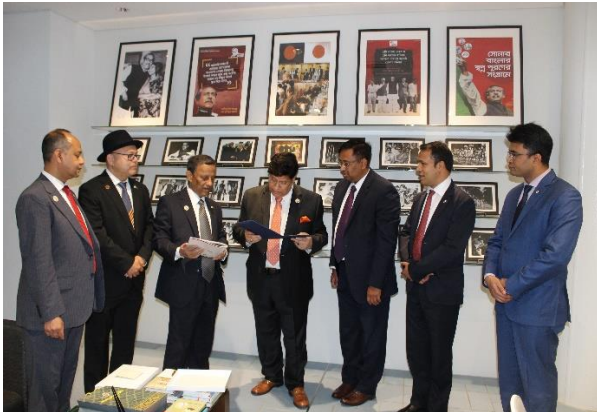
Foreign Minister was gifted with a set of commemorative stamps printed by Japan post on the occasion of the 50th anniversary of the establishment of the diplomatic relations between Bangladesh and Japan.

establishment of the diplomatic relations between Bangladesh and Japan on 10 February 2022. The Hon'ble Foreign Minister gifted two of his books to H.E. Ambassador.