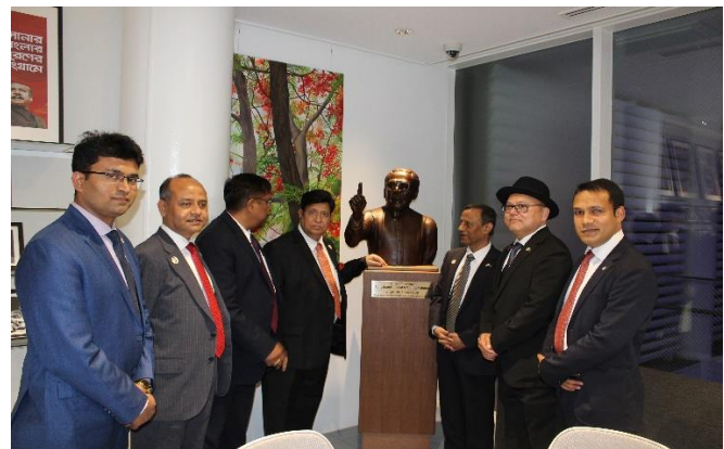
Foreign Minister praised the installation of the half bust of the Father of the Nation at the Bangabandhu Corner

The Foreign Minister visited the Bangabandhu Corner located on the 3rd floor and also praised the installation of the half bust of the Father of the Nation there. He was gifted with a set of commemorative stamps and the catalog of the Exhibition of diplomatic archive documents and photographs arranged on the occasion of the 50 th anniversary of the