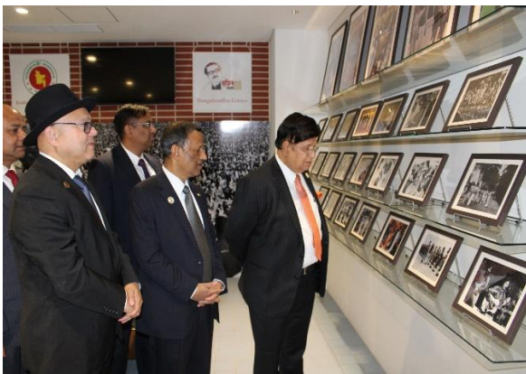
Foreign Minister visited the Bangabandhu Corner located on the 3rd floor of the Embassy