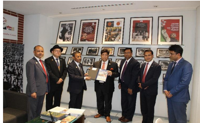
Foreign Minister was gifted with the catalog of the Exhibition of diplomatic archive documents on the occasion of the 50th anniversary of the establishment of the diplomatic relations between Bangladesh and Japan