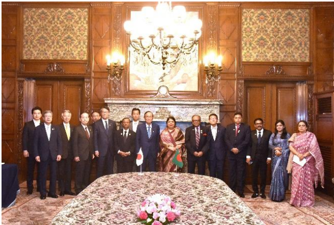
Hon'ble Speakers of Bangladesh and Japan inside the National Diet, May 2023

A Bangladesh Parliamentary delegation headed by Dr. Shirin Sharmin Chaudhury, MP, Hon'ble Speaker of the Parliament of the People's Republic of Bangladesh