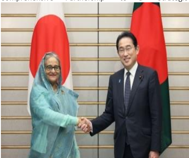
Hon'ble Prime Minister Sheikh Hasina shaking hands with Prime Minister Fumio Kishida at the Prime Minister's Office, Tokyo on 26 April 2023

Partnership" was a watershed event for the two countries' bilateral relations. During the visit, the Hon'ble Prime Minister met with His Majesty the Emperor of Japan Naruhito on 26 April at the Imperial Palace. This was the first meeting by any Head of Government with the Emperor after pandemic. Bangladesh also honoured four distinguished Japanese nationals with the 'Friends of Liberation War' honour during the visit.