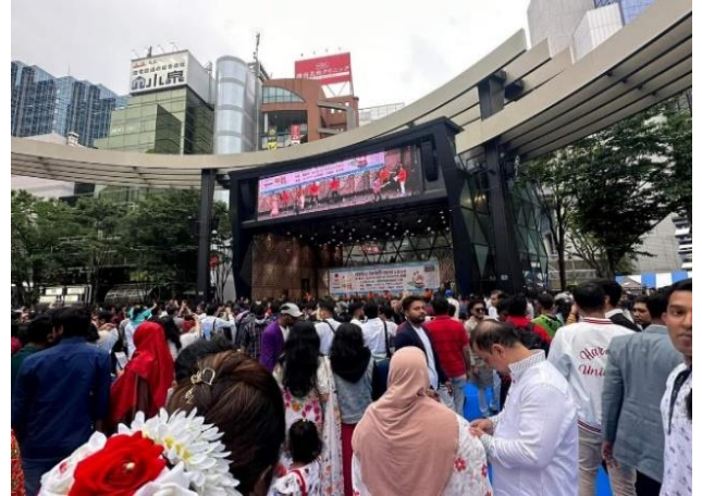
A segment of the participants at the Tokyo Boishakhi Mela