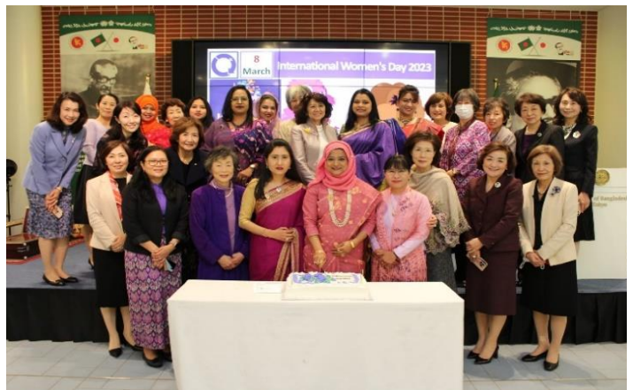
Cake cutting by the participants of the International Women's Day 2023