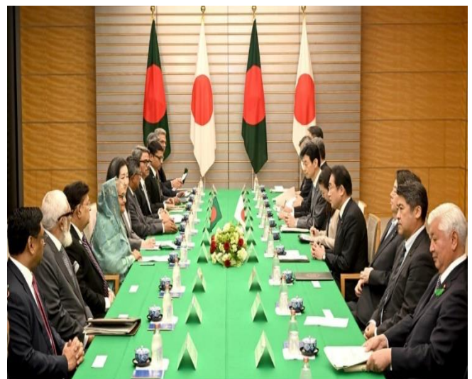
Hon'ble Prime Minister Sheikh Hasina leading the Bangladesh side to the bilateral talks with Prime Minister of Japan, H.E. Fumio Kishida on 26 April 2023