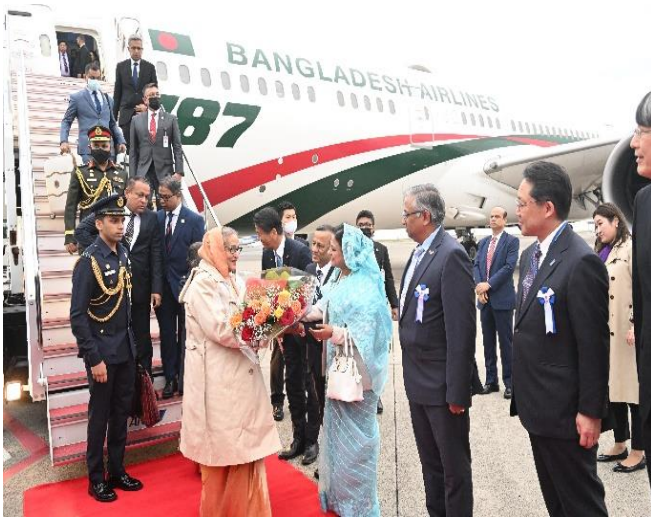
Hon'ble Prime Minister Sheikh Hasina is welcomed by H.E. Ambassador and spouse on arrival at the Haneda airport, Tokyo on 25 April 2023

to 02 December 2022, however, was postponed at the last moment due to Covid-19 pandemic situation in Japan. With the relaxation of the travel restrictions at the end of 2022 by Japan, the two sides worked to arrange the official visit of the Hon'ble Prime Minister to Japan was held on 25 to 28 April 2023.