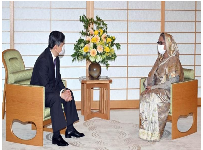
Hon'ble Prime Minister Sheikh Hasina met His Majesty the Emperor of Japan Naruhito at the Imperial Palace in Tokyo on 26 April 2023

During this visit the two Prime Minister signed a Joint Statement on "Strategic Partnership". Nine instruments were signed between the two countries to institutionalize cooperation in the areas of Customs, ICT and Cybersecurity, Defense, Industrial upgradation, Agriculture, Metro Rail, Ship Recycling, Intellectual property and Children's Library setup. The successful conclusion of the visit with the signing of the Joint Statement elevating the bilateral relations from "Comprehensive Partnership" to a "Strategic