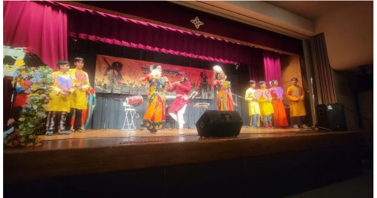
Colourful performance at the 14th Tokyo Spring Festival